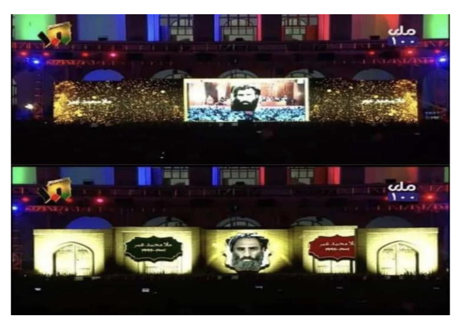
Image 1 Portrait of Mullah Omar, leader of the Taliban, on the 100<sup>th</sup> anniversary of Afghanistan Independence Day Celebration in Darulaman Palace, 2020