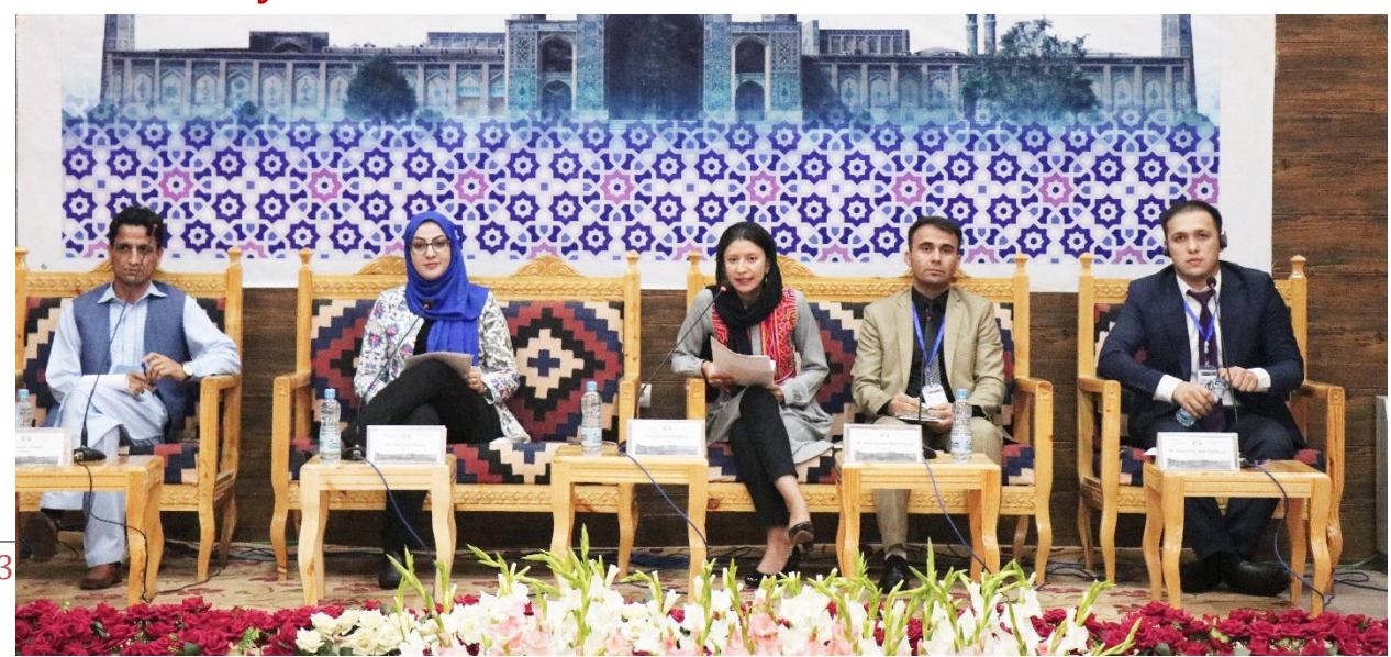
Panel 5: Democratic State; Democratic Society; Future of Democracy