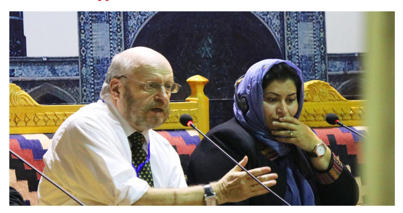
Panel 3: The State in Islamic Thought & Practices: Idealism; Realism; Disappointment