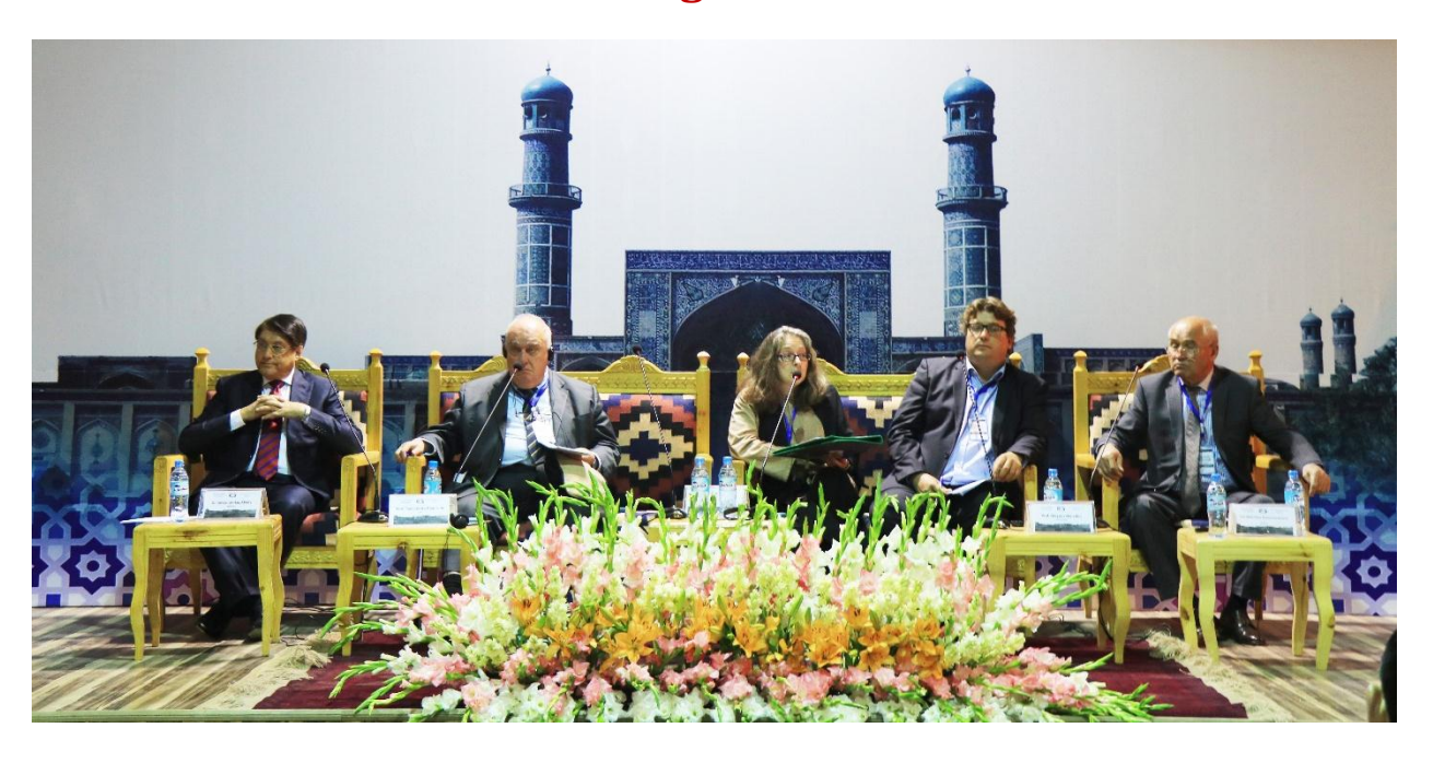
Panel 1: Nation-States: Blessing or Curse?