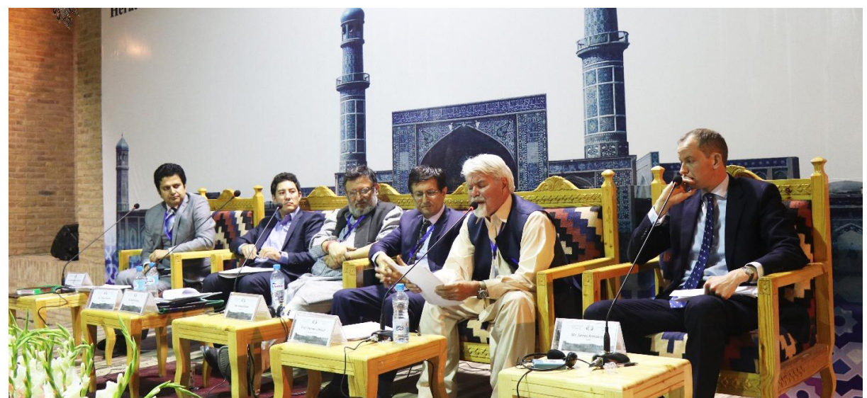
Panel 4: The Arduous Road of State-Building in Afghanistan: Legitimacy; Capacity; Hegemony